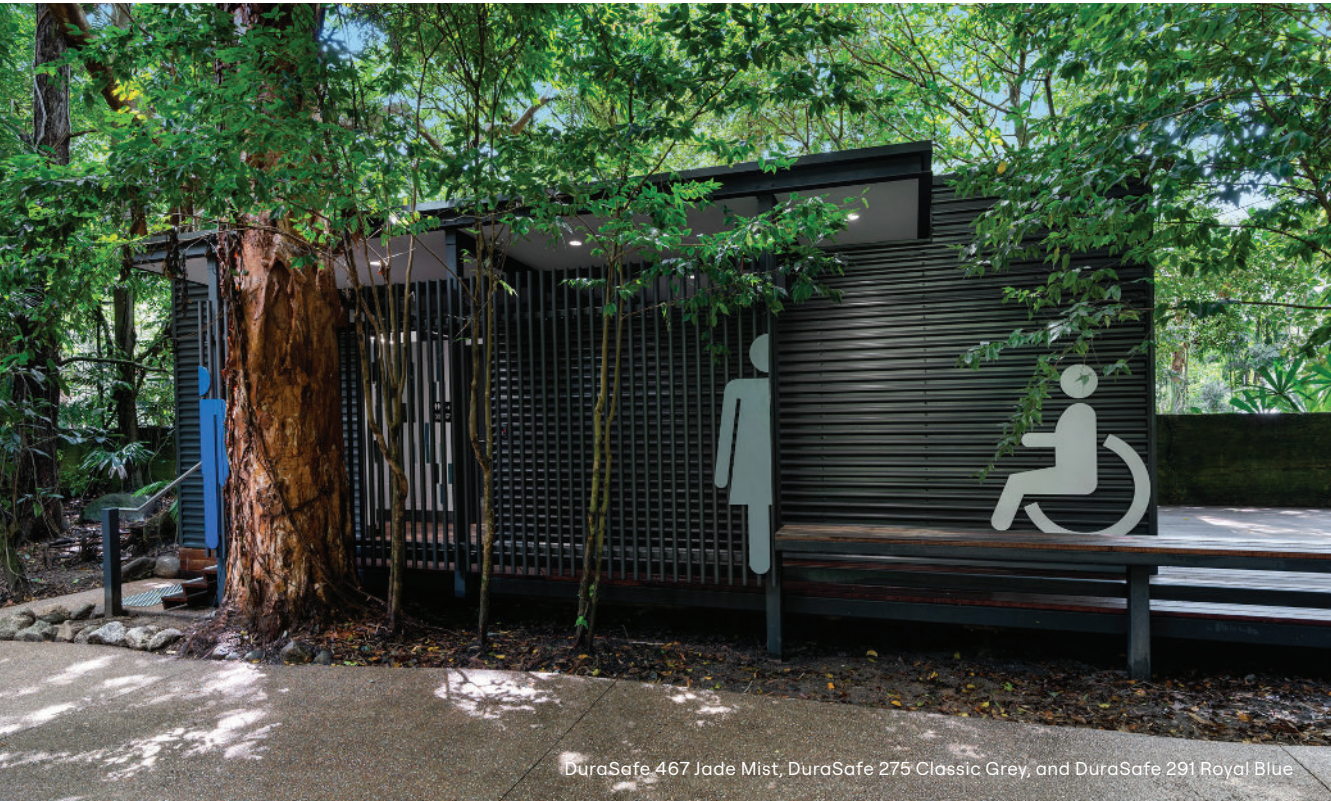
DuraSafe 467 Jade Mist, DuraSafe 275 Classic Grey, and DuraSafe 291 Royal Blue

DuraSafe Cut to Size Service is the ideal solution for custom designed furniture and joinery including tables, desks, benchtops, doors and wall panels.