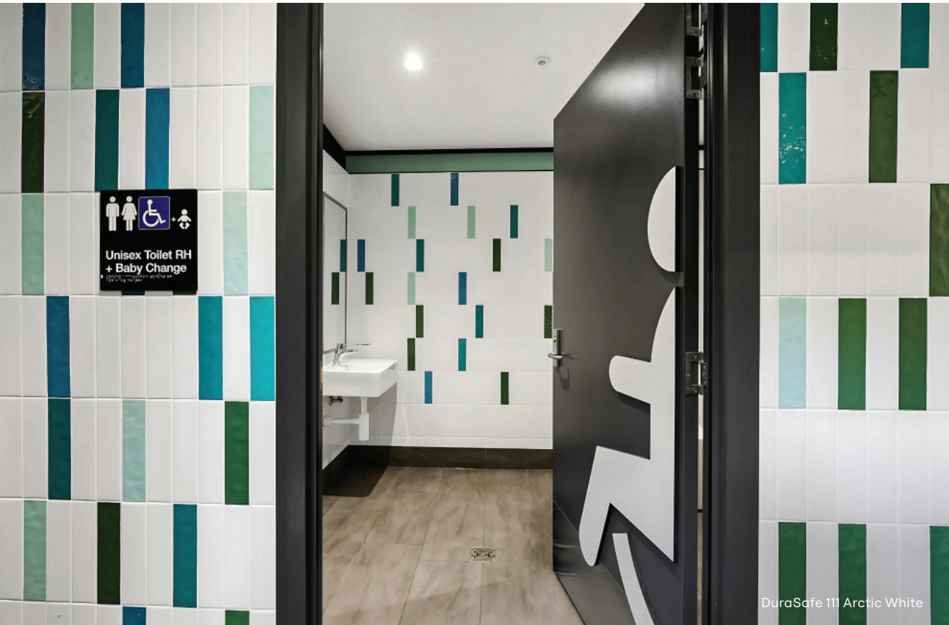
DuraSafe 111 Arctic White